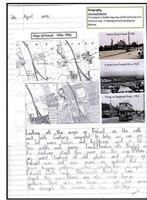
Year 2 children have been looking at maps in Geography. They are fascinated to find out that there was once a cinema in Station Road