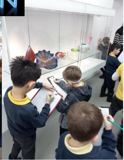
Class 2 were the first Year 2 class to visit the Glass Centre, observe glass blowing first hand, look around the displays of Art and then design and make their own glass pieces..