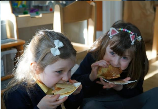
Reception children loved making and eating pancakes this week!