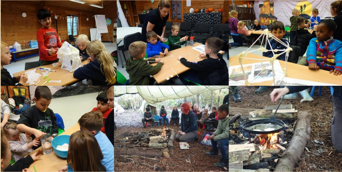
The building of the houses and baking of the bread are photographed above.