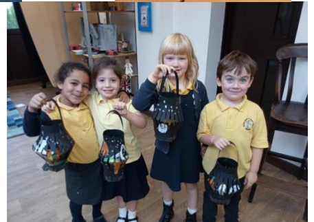
Year 1 and 2 children enjoying Art clubs.