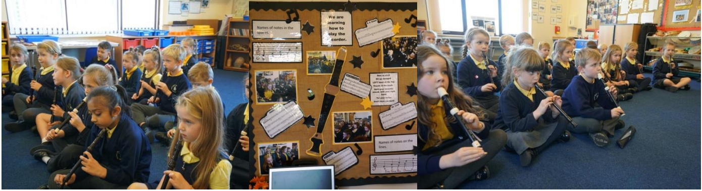
I have joined the Year 2 recorder group who are doing very well to play notes B and A without squeaking...