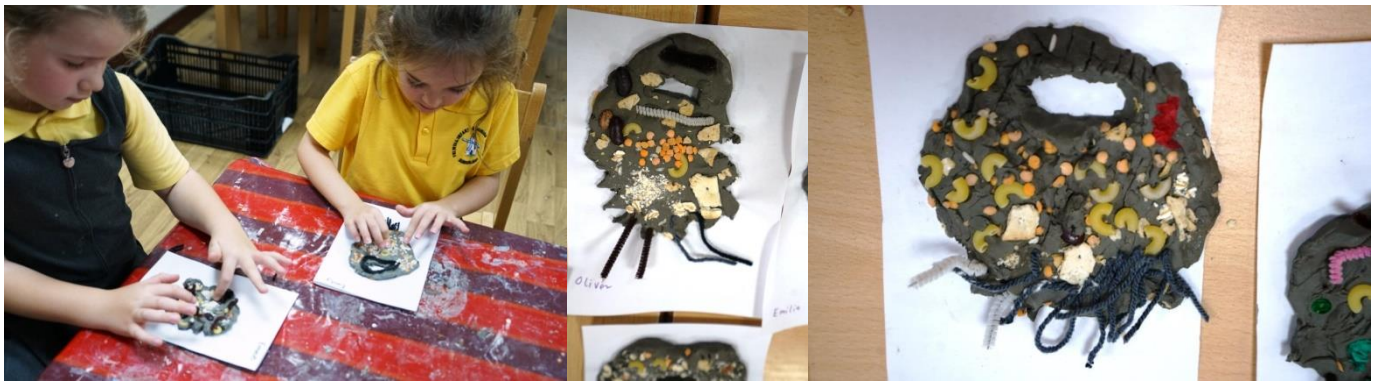
Year 2 children have been using clay in class to design and make Mr Twit's beards. They certainly look gruesome!