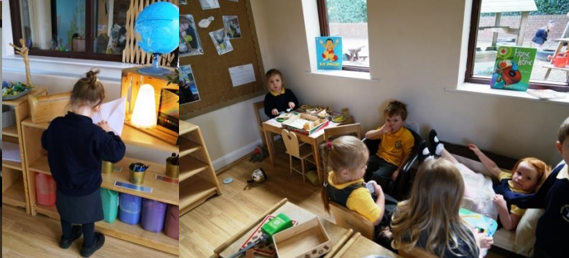
Nursery children enjoying th superb nursery environment. They have settled so well and are engaging with many new experiences and making friends...